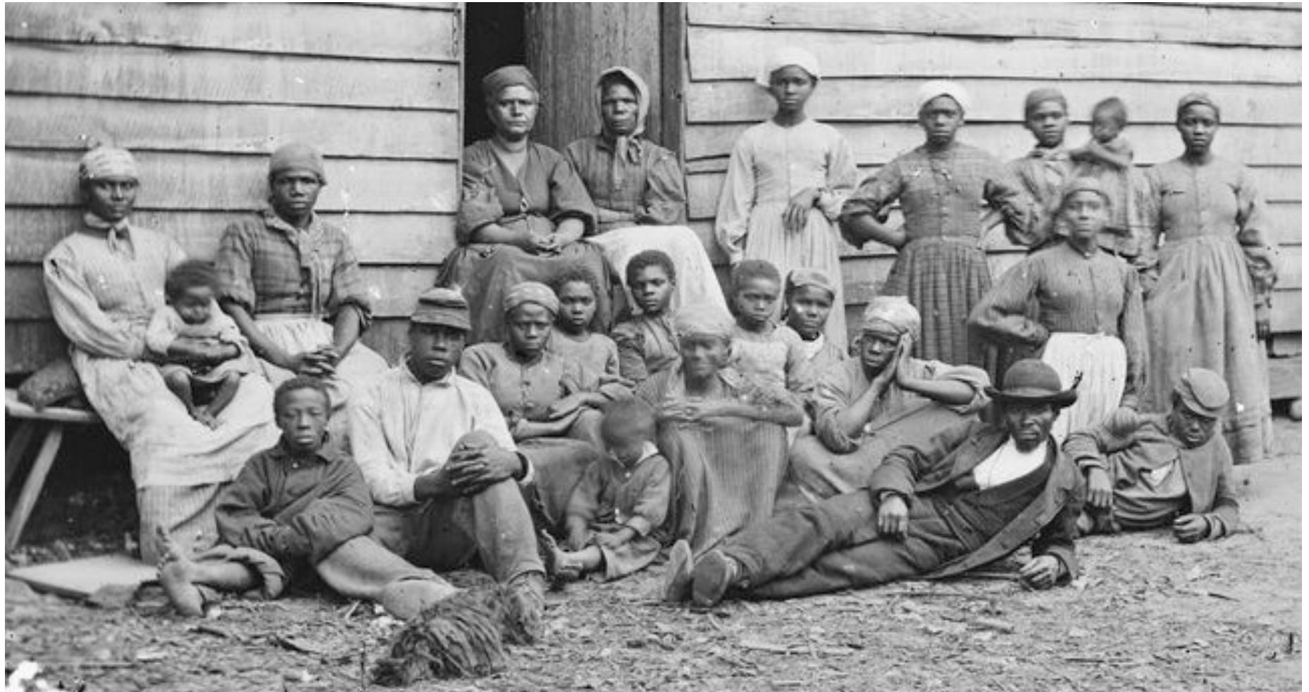
Fugitive slaves, known as "contrabands," who escaped across Union lines in Virginia, 1862.