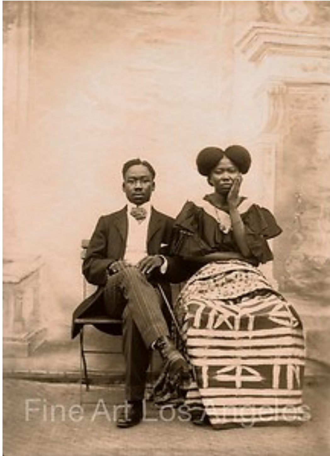
Formal portrait of an African couple, 1900