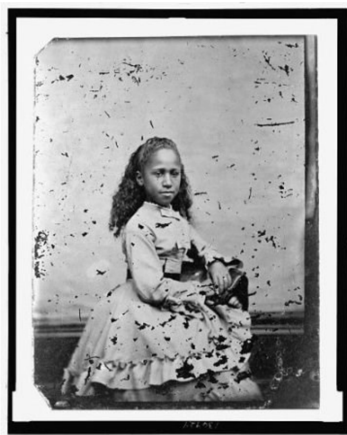
Portrait of young African American girl, 1870-1900