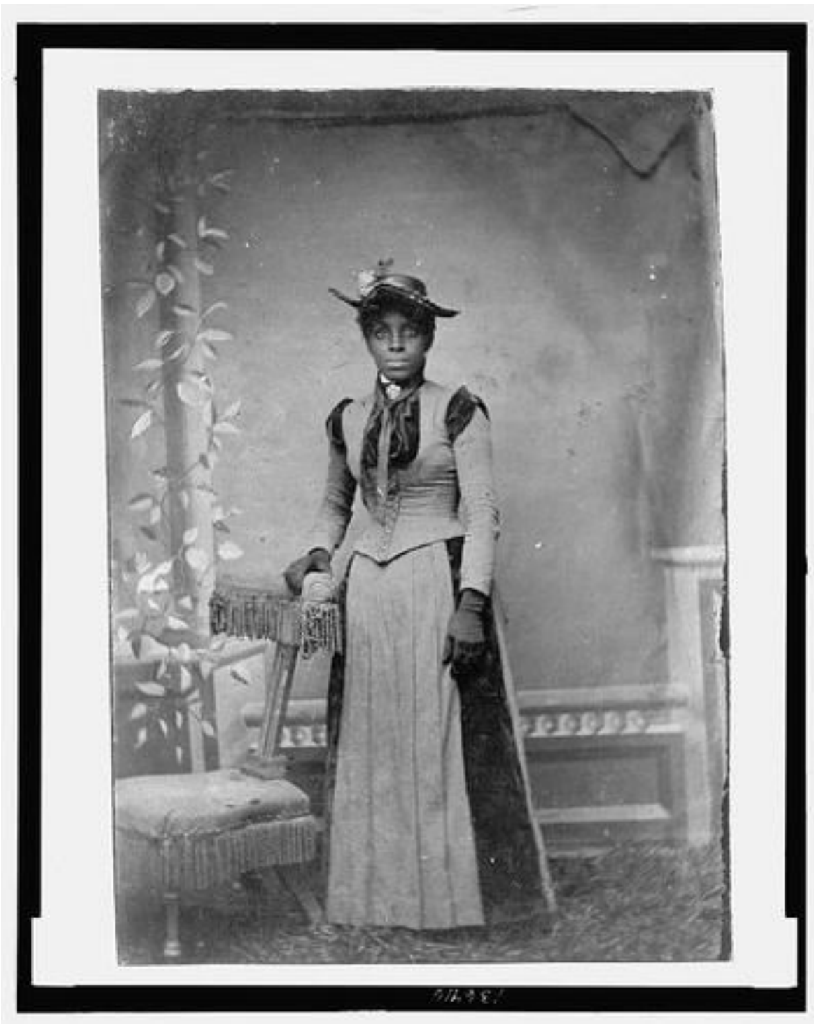
An ex-slave woman posing