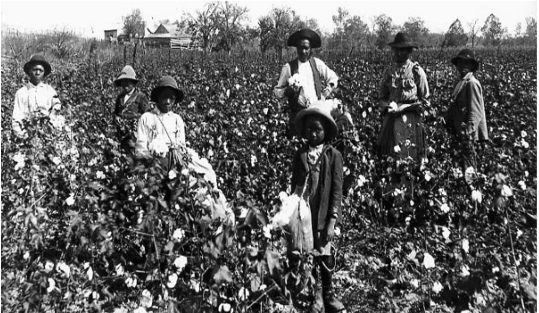
A group of enslaved people picking cotton in the field