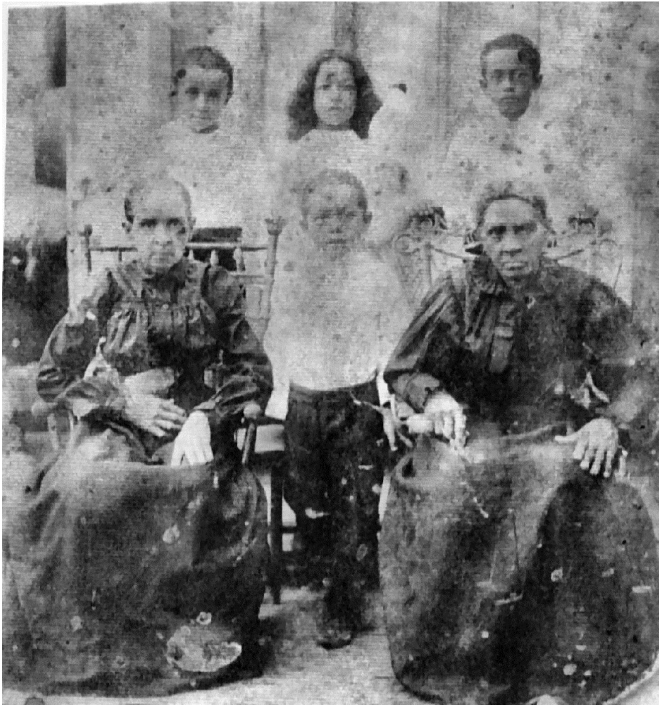
A family of two elderly women and four children