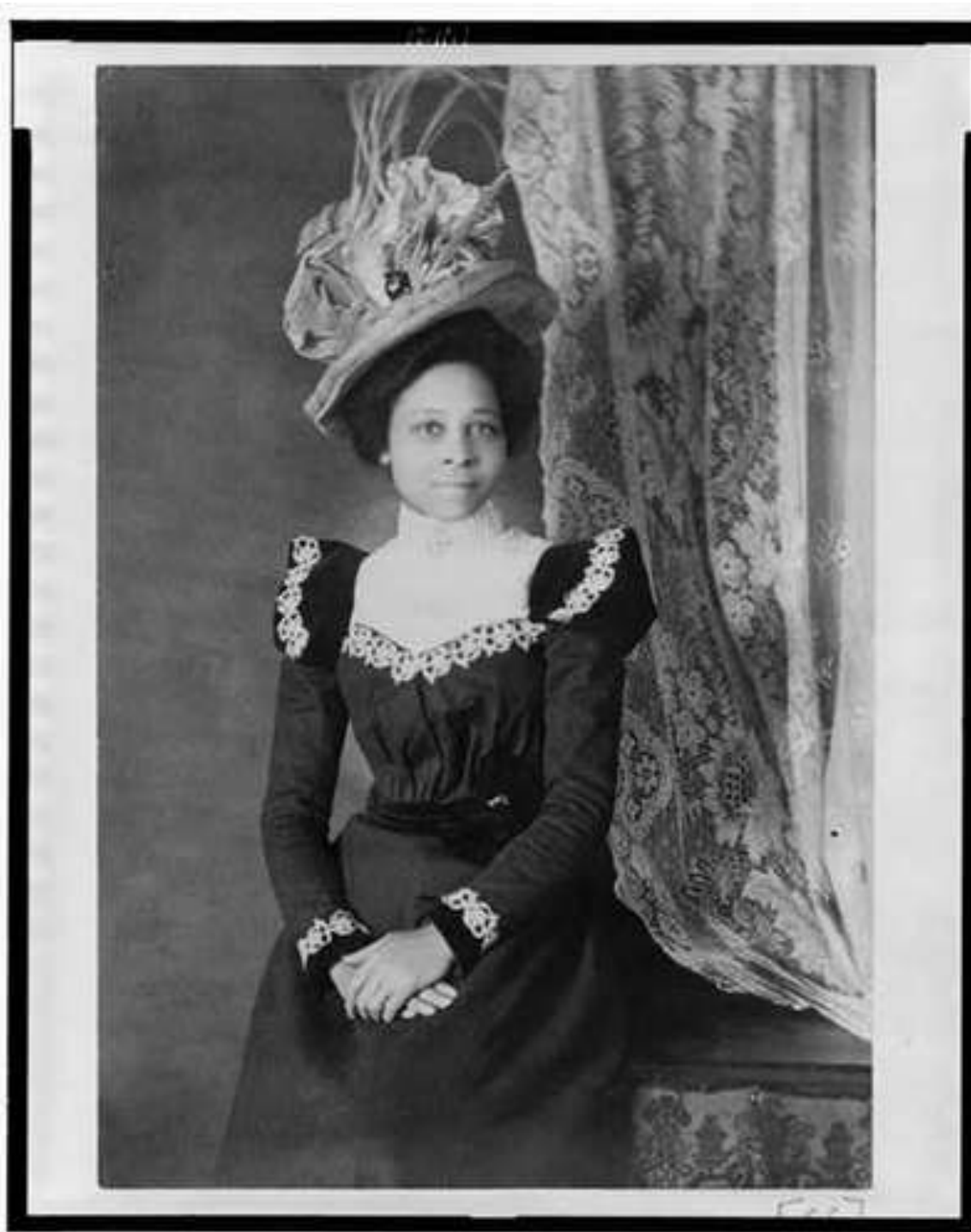
A former enslaved woman (Vintage)