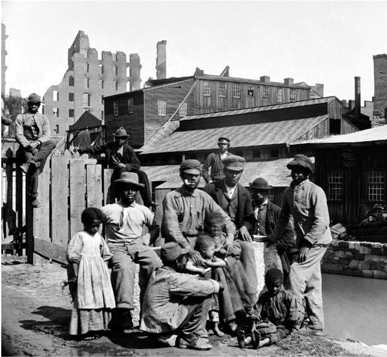
A group of enslaved people posing